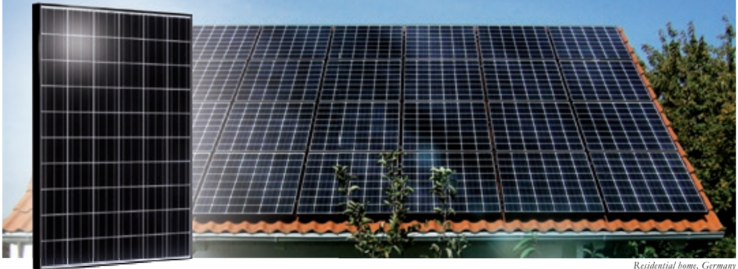
Residential home, Germany